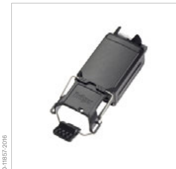
Dräger X-am® 125 external pump

External pump for hose length of up to 45 meters (147 feet). Makes it possible to use the detector for pre-entry measurements into confined spaces such as tanks, shafts, etc. The pump starts automatically when the detector is attached. The change between diffusion and pump operation is quick and easy without any need for additional tools or steps.